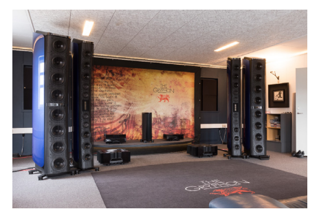
Home of the Gryphon is located in beautiful surroundings in Ry, Denmark